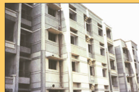
Gurgaon (Phase-II) Housing Scheme