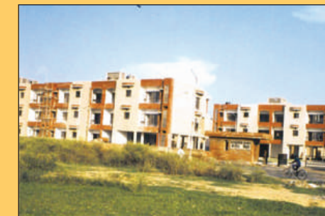
Chandigarh Housing Scheme