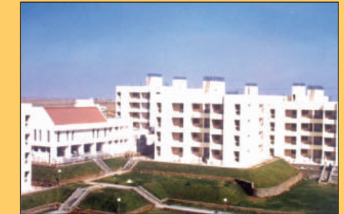
Pune (Phase-I), Housing Scheme