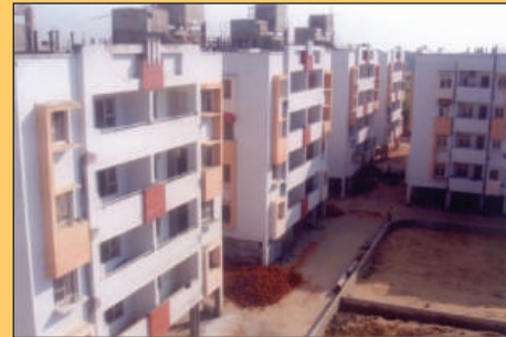
Bhubaneswar (Phase-I), Housing Scheme