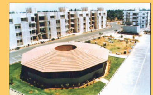
Chennai (Phase-I) Housing Scheme