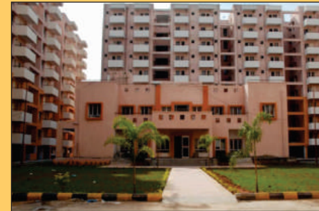
Hyderabad (Phase-III), Housing Scheme