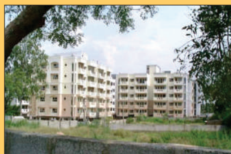
Hyderabad (Phase-II) Housing Scheme