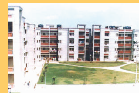
Noida (Phase-II) Housing Scheme