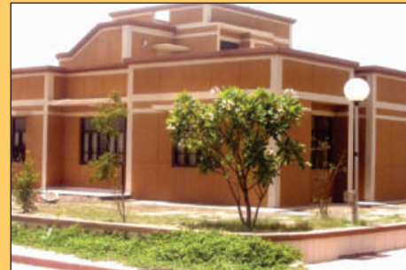
Army Institute of Management of Technology (Greater Noida) Phase-II