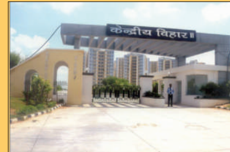
Jaipur (Phase-I) Housing Scheme