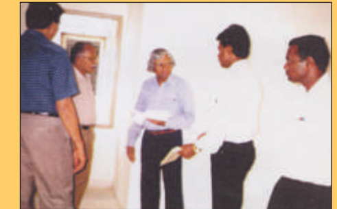
Allotee of Bangalore House Scheme Dr. A. P. J. Abdul Kalam (Centre)