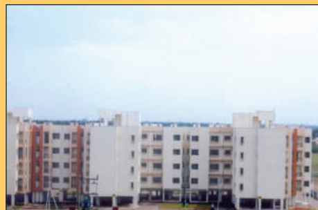
Chennai (Phase-I) Housing Scheme