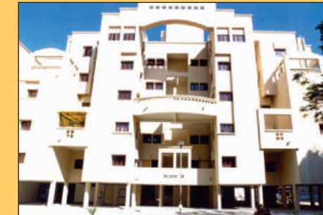
Hyderabad (Phase-I) Housing Scheme