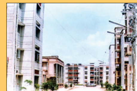
Noida (Phase-I) Housing Scheme