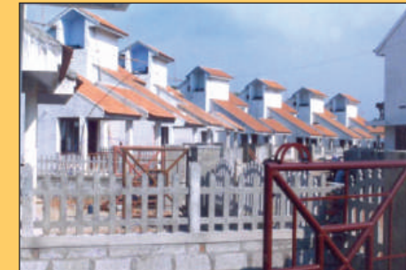
Kochi Housing Scheme