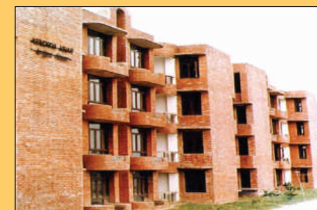
Panchkula (Phase-I) Housing Scheme