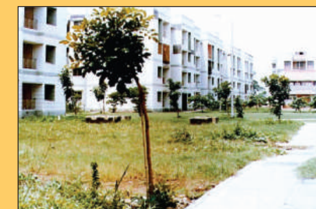
Nerul, New Bombay Housing Scheme