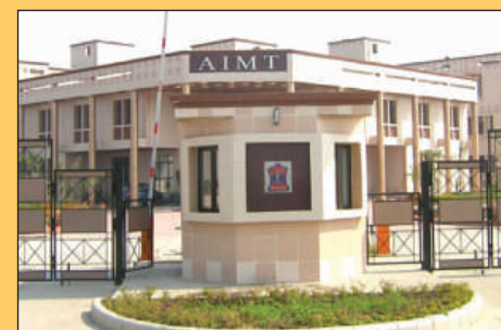
Army Institute of Management and Technology (Greater Noida) Phase-I