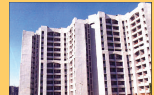
Kharghar, Navi Mumbai Housing Scheme