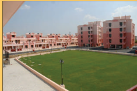
Lucknow Housing Scheme