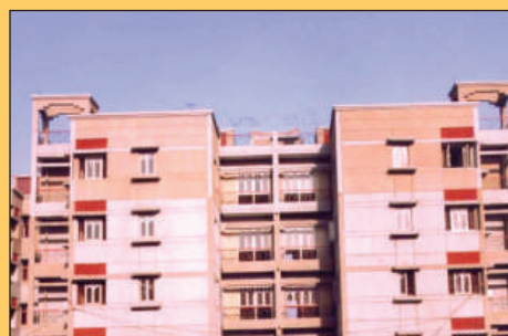
Gurgaon (Phase-I) Housing Scheme