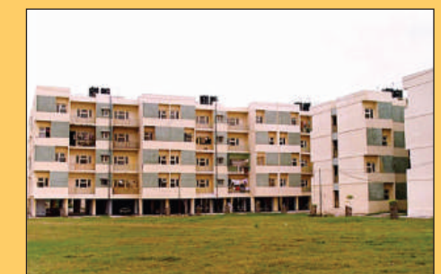
Kolkata (Phase-I) Housing Scheme