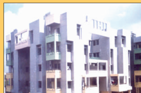
Ahmedabad Housing Scheme