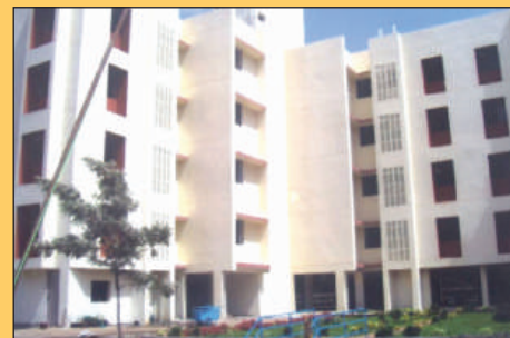
Pune (Phase-II) Housing Scheme