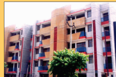
Panchkula (Phase-II) Housing Scheme