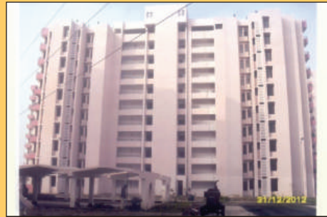
Mohali (Phase-I) Housing Scheme