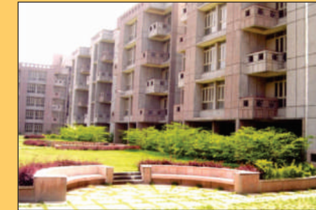
Noida (Phase-III), Housing Scheme