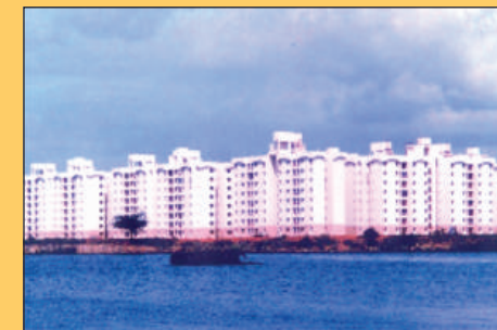
Bangalore Housing Scheme