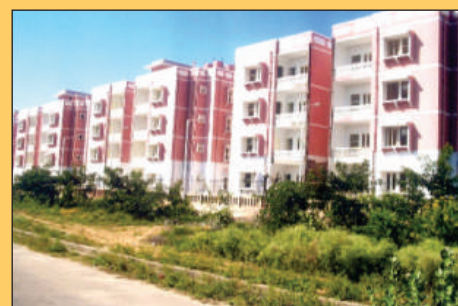
Jaipur (Phase-I) Housing Scheme