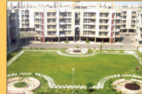
Noida (Phase-IV) Housing Scheme